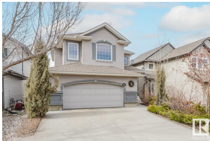
1912 121 St SW, Edmonton, AB