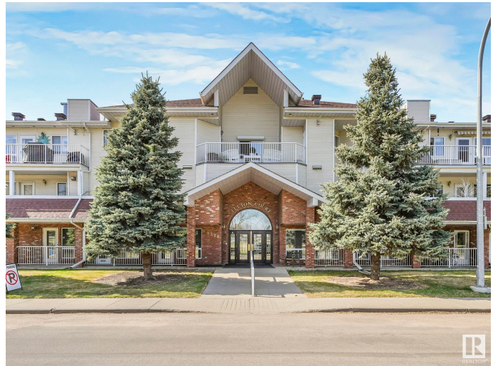
129-6220 Fulton Rd NW, Edmonton, AB